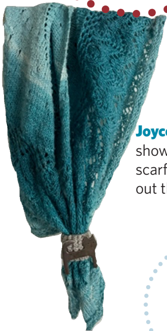
Joyce Cook showed her lace scarf, pointing out the cat pin.