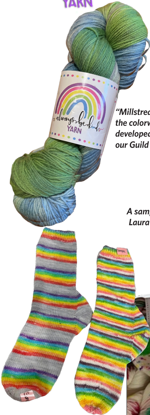
"Millstream," the colorway developed for our Guild

She developed this heel construction (diamond heel) to keep the stripes aligned. Her sock patterns are also available on the web.