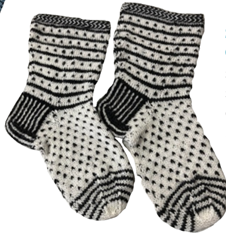
Sandy Galbraith showed the socks she'd entered in the State Fair.