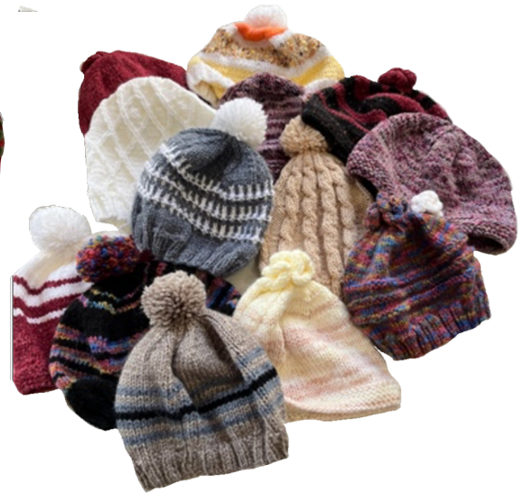
Kathy Goebel showed the numerous hats for donation she knit all with scrap yarn.