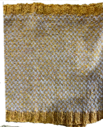
Sandy Galbraith knit this cowl using yarn from the Library craft sale.